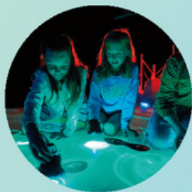
Sea of Light

Get creative with the kids this September school holidays. We've got a huge range of free activities alongside our events including music, storytelling, craft, circus, theatre and much more!