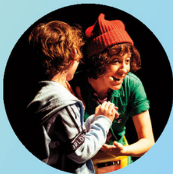
Dr AudiYo's Giant Adventure